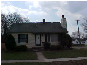
Item 1 of 3 1 Image / 2 Sketches