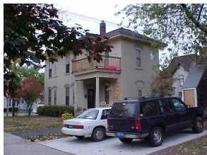
Item 1 of 4 2 Images / 2 Sketches