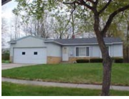
Item 1 of 3 1 Image / 2 Sketches